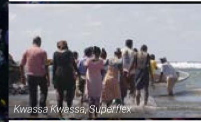
Kwassa Kwassa, Superflex

In 2020, in honour of the 400th anniversary of the Mayflower's journey, the JST will undertake a voyage from Plymouth, England to Plymouth, Mass, empowering a socially inclusive crew as they sail along the Mayflower's original route, giving them the chance to experience a life changing adventure. The Trust's visit to Plymouth will be accompanied by a range of activities celebrating diversity and promoting social inclusion.